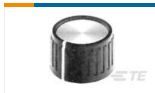
TE Part #6-1437624-9 PKG90B1/4=KNOB PLASTIC 1/4 LEX