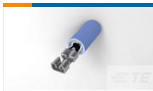
TE Part #640931-1 RECEPT,PIDG FASTON 16-14 110