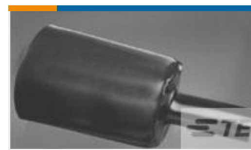
TE Part #CX7197-000 RHW-110/30-1200/ADH-0