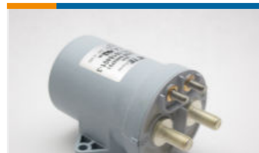
TE Part #7-1618401-3 LEV200A4NAF01=Contactor, w/Coil Sup