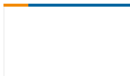
TE Part #FPP810B328 QLS3854 720 PC C8 AGC S PROD