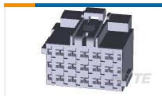
TE Part #1-967625-6 JUN-POW-TIM GEH 21P