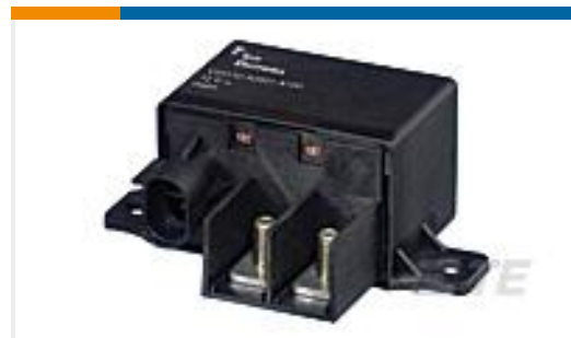
TE Part #1-1393315-1 V23132B2002B200=HCR