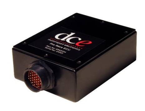
EPAS104 Pro Race ECU

The system comprises the following components: