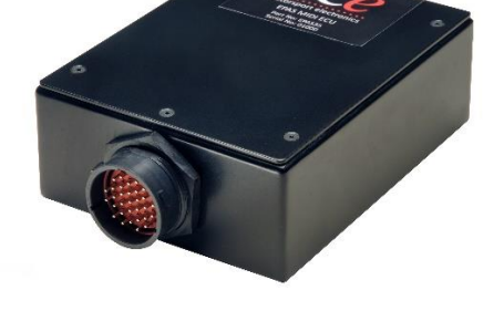
EPAS18 - Ultra ECU