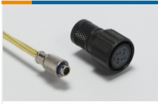
Standard Circular Connectors(567)