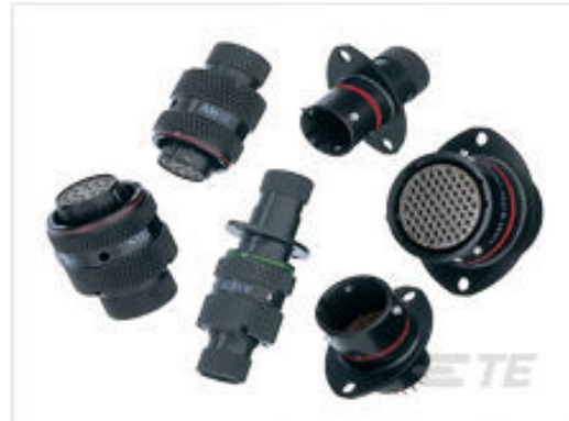
TE Part #AS622-21PN PLUG BOOT TERMIN TYPE 6