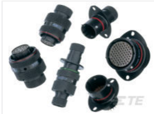
TE Part #AS008-35SD RECEPT.2 HOLE MNT.TYPE 0