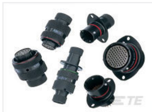
TE Part #AS608-98PN PLUG BOOT TERMINN TYPE 6