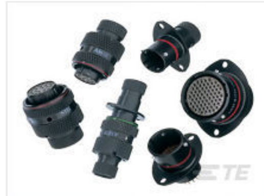
TE Part #AS612-35PA PLUG BOOT TERMIN'N TYPE 6