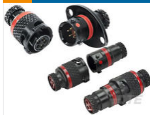
TE Part #ASU103-03SB-HE RECEPT ASSY INLINE AS 3 WAY