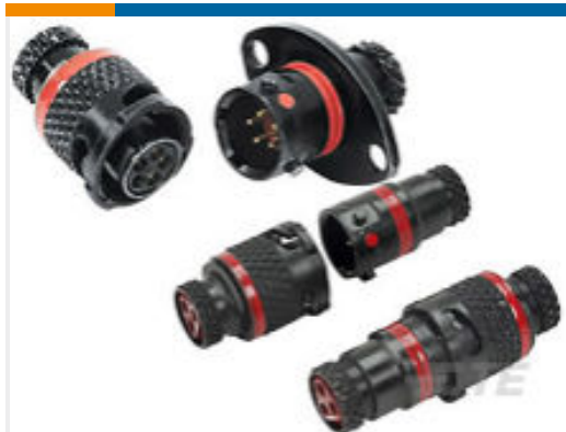
TE Part #ASU103-03SN-HE RECEPT ASSY INLINE AS 3 WAY