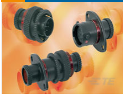
TE Part #ASDD608-11PN PLUG ASSY 8-11 AS DOUBLE DENSITY