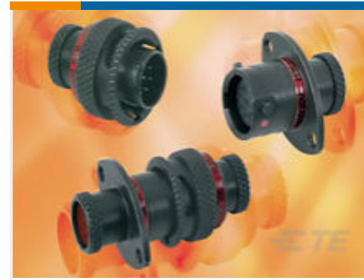
TE Part #ASDD106-09PN-HE INLINE RECEPT ASSY. ASDD 9 WAY.