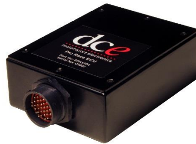
EPAS104 Pro Race ECU

The system comprises the following components: