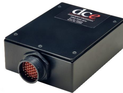
EPAS35 – MIDI ECU

The EPAS18 ECU is designed for professional users and comes complete with Autosport connectors for interfacing with the wiring harness. The ECU casing is machined from billet and contains a high efficiency heatsink to help wick away unwanted thermal energy to ensure the system works at maximum effect.