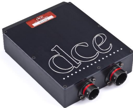
EPAS18 – Ultra ECU

Two types of control unit are available to operate with the EPAS01 Motor/Gearbox.