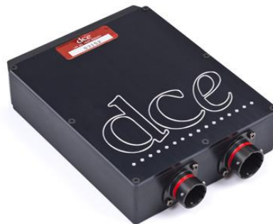
EPAS Ultra ECU

The EPAS Ultra ECU is designed to work with the DCE EPAS01 Column Assist unit as well as OEM steering Columns from GM such as the Opel Corsa/Holden Barina MKB & C