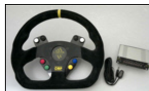
Wireless Steeringwheel Pushbutton Controls