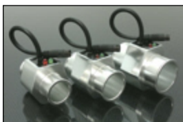
Coolant Level Alarms