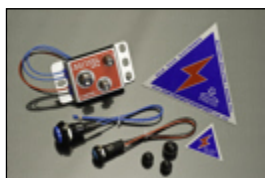
Solid State Battery Isolators